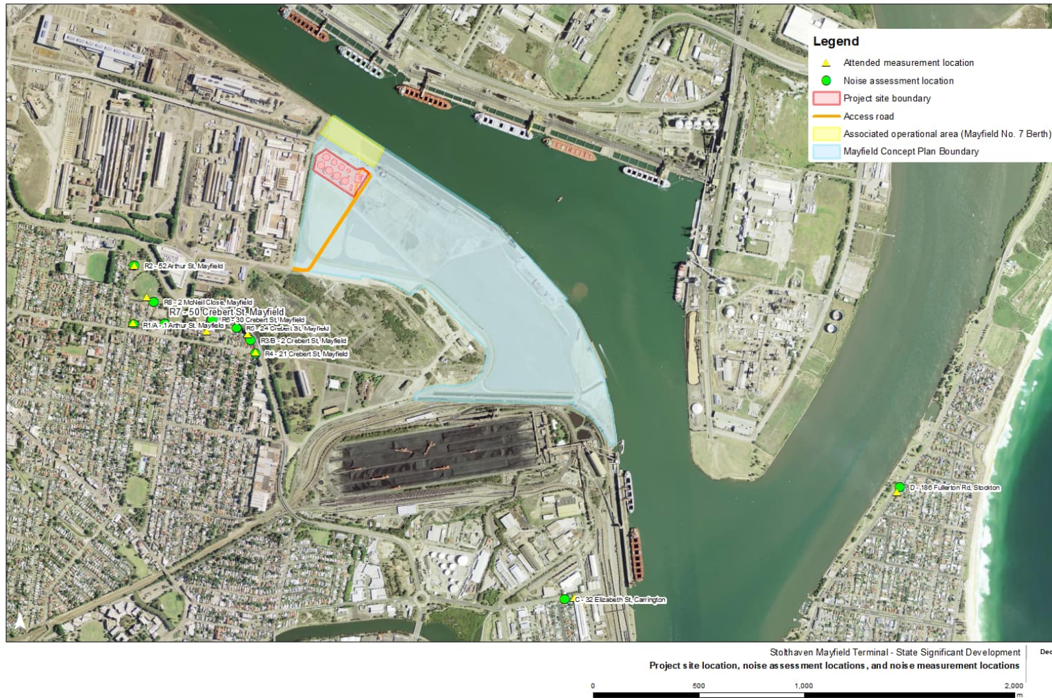
Figure 1 Site Location, Assessment Receiver Locations and Measurement Locations